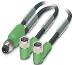
Sensor/actuator cable, 3-position, PUR halogen-free, black-gray RAL 7021, Plug straight M8, coding: A, on Socket angled M8 and Socket angled M8, cable length: 0.6 m

Please be informed that the data shown in this PDF document is generated from our online catalog. Please find the complete data in the user documentation. Our general terms of use for downloads are valid.