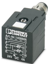
Valve connectors, 5-position, Plug angled M12 SPEEDCON, coding: A, with 2 LEDs, on Valve connector AD (Druckschalter), with 2 LEDs

Please be informed that the data shown in this PDF document is generated from our online catalog. Please find the complete data in the user documentation. Our general terms of use for downloads are valid.