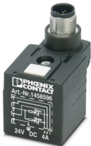
Valve connectors, 5-position, Plug straight M12 SPEEDCON, coding: A, with 2 LEDs, on Valve connector AD (Druckschalter), with 2 LEDs

Please be informed that the data shown in this PDF document is generated from our online catalog. Please find the complete data in the user documentation. Our general terms of use for downloads are valid.