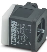
Valve connectors, Universal, 3-position, Valve connector A, Screw connection, cable gland M16, external cable diameter 6 mm ... 8 mm

Please be informed that the data shown in this PDF document is generated from our online catalog. Please find the complete data in the user documentation. Our general terms of use for downloads are valid.