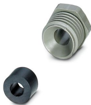
Sensor/actuator connector, accessories, pressure screw and seal, for unshielded M8 connector, cable diameter 2.2 mm - 3.5 mm

Please be informed that the data shown in this PDF document is generated from our online catalog. Please find the complete data in the user documentation. Our general terms of use for downloads are valid.