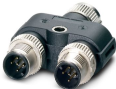
Y distributor, 5-position, Socket straight M12 SPEEDCON, coding: A, on Plug straight M12 SPEEDCON, coding: A and Plug straight M12 SPEEDCON, coding: A, Parallel distributor

Please be informed that the data shown in this PDF document is generated from our online catalog. Please find the complete data in the user documentation. Our general terms of use for downloads are valid.