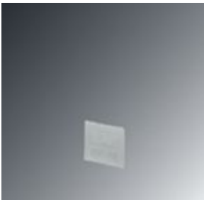
End cover, length: 28 mm, width: 1 mm, height: 26.2 mm, color: gray

Please be informed that the data shown in this PDF Document is generated from our Online Catalog. Please find the complete data in the user's documentation. Our General Terms of Use for Downloads are valid ( http://phoenixcontact.com/download )