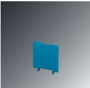
End cover, length: 28 mm, width: 2.5 mm, height: 30.2 mm, color: blue

Please be informed that the data shown in this PDF Document is generated from our Online Catalog. Please find the complete data in the user's documentation. Our General Terms of Use for Downloads are valid ( http://phoenixcontact.com/download )