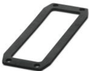
Replacement flat gasket, for HEAVYCON panel mounting base, HC-STA...AL, type B10, conductive

Please be informed that the data shown in this PDF Document is generated from our Online Catalog. Please find the complete data in the user's documentation. Our General Terms of Use for Downloads are valid ( http://phoenixcontact.com/download )