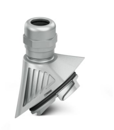
EVO metal cable gland with bayonet locking, B series, size M20, cable diameter: 7 - 13 mm

Please be informed that the data shown in this PDF document is generated from our online catalog. Please find the complete data in the user documentation. Our general terms of use for downloads are valid.