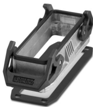
HEAVYCON B24 panel mounting base, with double locking latch, with flat gasket, salt-water-resistant aluminum, conductive profile gasket

Please be informed that the data shown in this PDF document is generated from our online catalog. Please find the complete data in the user documentation. Our general terms of use for downloads are valid.