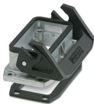
HEAVYCON panel mounting base, B10, with single locking latch, with flat gasket, salt-water-resistant aluminum, conductive profile gasket

Please be informed that the data shown in this PDF document is generated from our online catalog. Please find the complete data in the user documentation. Our general terms of use for downloads are valid.