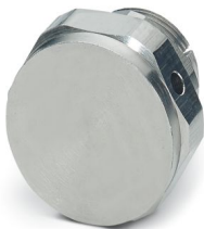
Pressure compensation element, application: Ex, connecting thread: M25 x 1.5, color: silver

Please be informed that the data shown in this PDF document is generated from our online catalog. Please find the complete data in the user documentation. Our general terms of use for downloads are valid.