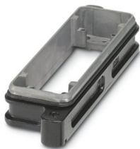
HEAVYCON B24 panel mounting base, HPR series, for screw locking, for increased environmental and EMC requirements

Please be informed that the data shown in this PDF document is generated from our online catalog. Please find the complete data in the user documentation. Our general terms of use for downloads are valid.