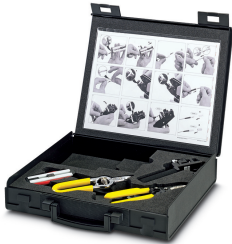
Tool set for PCF assembly, for 200/230 \mu\text{m} , 50/200/230 \mu\text{m} , and 62.5/200/230 \mu\text{m} PCF fibers

Please be informed that the data shown in this PDF Document is generated from our Online Catalog. Please find the complete data in the user's documentation. Our General Terms of Use for Downloads are valid ( http://phoenixcontact.com/download )