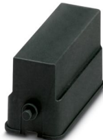
Protective cover for sleeve housing, IP54

Please be informed that the data shown in this PDF document is generated from our online catalog. Please find the complete data in the user documentation. Our general terms of use for downloads are valid.