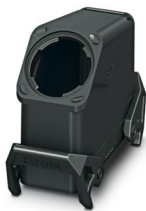
HEAVYCON EVO sleeve housing, plastic, with bayonet flange for EVO screw connection, B24, with double locking latch, height: 87.5 mm, without EVO screw connection

Please be informed that the data shown in this PDF document is generated from our online catalog. Please find the complete data in the user documentation. Our general terms of use for downloads are valid.