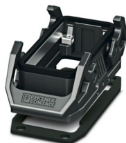
HEAVYCON EVO panel mounting base, plastic, B16, with double locking latch, height: 30.5 mm, with flat gasket

Please be informed that the data shown in this PDF document is generated from our online catalog. Please find the complete data in the user documentation. Our general terms of use for downloads are valid.