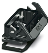
HEAVYCON EVO panel mounting base, plastic, B16, with single locking latch, height: 30.5 mm, with flat gasket

Please be informed that the data shown in this PDF document is generated from our online catalog. Please find the complete data in the user documentation. Our general terms of use for downloads are valid.