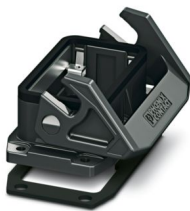
HEAVYCON EVO panel mounting base, plastic, B10, with single locking latch, height: 30.5 mm, with flat gasket

Please be informed that the data shown in this PDF document is generated from our online catalog. Please find the complete data in the user documentation. Our general terms of use for downloads are valid.