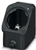
HEAVYCON EVO sleeve housing, plastic, with bayonet flange for EVO screw connection, B10, for single locking latch, height: 60.5 mm, without EVO screw connection

Please be informed that the data shown in this PDF document is generated from our online catalog. Please find the complete data in the user documentation. Our general terms of use for downloads are valid.