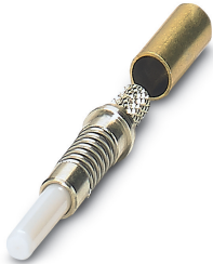
Replacement ferrule set (10 pcs.) for M12 PCF fiber optic connector (Order No. 1416619)

Please be informed that the data shown in this PDF Document is generated from our Online Catalog. Please find the complete data in the user's documentation. Our General Terms of Use for Downloads are valid ( http://phoenixcontact.com/download )