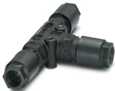
QUICKON T-distributor, black, 4+PE-pos., 1.0 mm 2 ... 2.5 mm 2 /690 V/20 A, for cable diameter of 9 mm ... 16 mm, with three QUICKON nuts

Please be informed that the data shown in this PDF document is generated from our online catalog. Please find the complete data in the user documentation. Our general terms of use for downloads are valid.