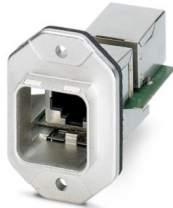
RJ45 panel mounting frame, IP67, for push-pull interlocking, metal, with the Freenet system, for rectangular mounting cutout, with seal, without mounting screws: incl. socket/socket insert

Please be informed that the data shown in this PDF document is generated from our online catalog. Please find the complete data in the user documentation. Our general terms of use for downloads are valid.