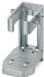
HEAVYCON plug assembly frame, lower part for double locking latch, for sleeve housing with double locking latch or HC-CIF-..HFFD..., for type B10 contact inserts, for NS35/7,5 DIN rails

Please be informed that the data shown in this PDF Document is generated from our Online Catalog. Please find the complete data in the user's documentation. Our General Terms of Use for Downloads are valid ( http://phoenixcontact.com/download )