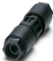
QUICKON cable connector, black, 4+PE-pos., 1.0 mm 2 ... 2.5 mm 2 / 690 V / 20 A, for 6 mm ... 11 mm cable diameter.

Please be informed that the data shown in this PDF document is generated from our online catalog. Please find the complete data in the user documentation. Our general terms of use for downloads are valid.