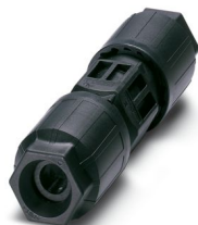
QUICKON cable connector, black, 4+PE-pos., 1.0 mm 2 ... 2.5 mm 2 / 690 V / 20 A, for 9 mm ... 16 mm cable diameter.

Please be informed that the data shown in this PDF document is generated from our online catalog. Please find the complete data in the user documentation. Our general terms of use for downloads are valid.