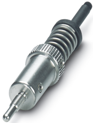
Service tool, for CF-CRIMPHANDY 1,5, for rectifying malfunctions

Please be informed that the data shown in this PDF Document is generated from our Online Catalog. Please find the complete data in the user's documentation. Our General Terms of Use for Downloads are valid ( http://phoenixcontact.com/download )