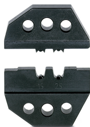
Spare die for CRIMPFOX-TC 2,5

Please be informed that the data shown in this PDF Document is generated from our Online Catalog. Please find the complete data in the user's documentation. Our General Terms of Use for Downloads are valid ( http://phoenixcontact.com/download )