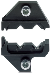
Die for crimping machine CF 500, for turned contacts with 4.0 mm pin diameter (CK 4.0) 6 ... 10 mm 2

Please be informed that the data shown in this PDF Document is generated from our Online Catalog. Please find the complete data in the user's documentation. Our General Terms of Use for Downloads are valid ( http://phoenixcontact.com/download )