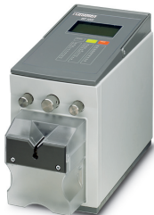
Stripping machine with integrated graphic display, for conductors and cables up to 6 mm in diameter, 120 V version

Please be informed that the data shown in this PDF Document is generated from our Online Catalog. Please find the complete data in the user's documentation. Our General Terms of Use for Downloads are valid ( http://phoenixcontact.com/download )