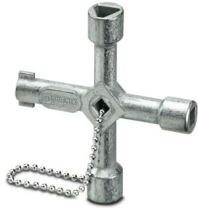
Control cabinet key, metal, for all common types of control cabinet

Please be informed that the data shown in this PDF document is generated from our online catalog. Please find the complete data in the user documentation. Our general terms of use for downloads are valid.