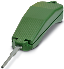
Alignment tool for cable markers, green, unlabeled, mounting type: insert, lettering field size: 4 x 2.1 mm

Please be informed that the data shown in this PDF Document is generated from our Online Catalog. Please find the complete data in the user's documentation. Our General Terms of Use for Downloads are valid ( http://phoenixcontact.com/download )