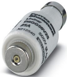
Fuse insert, nominal current: 25 A, length: 50 mm, diameter: 22 mm, color: yellow

Please be informed that the data shown in this PDF Document is generated from our Online Catalog. Please find the complete data in the user's documentation. Our General Terms of Use for Downloads are valid ( http://phoenixcontact.com/download )