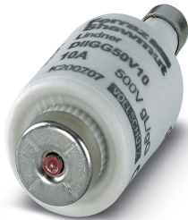
Fuse insert, nominal current: 10 A, length: 50 mm, diameter: 22 mm, color: red

Please be informed that the data shown in this PDF Document is generated from our Online Catalog. Please find the complete data in the user's documentation. Our General Terms of Use for Downloads are valid ( http://phoenixcontact.com/download )