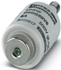
Fuse insert, nominal current: 6 A, length: 50 mm, diameter: 22 mm, color: green

Please be informed that the data shown in this PDF Document is generated from our Online Catalog. Please find the complete data in the user's documentation. Our General Terms of Use for Downloads are valid ( http://phoenixcontact.com/download )