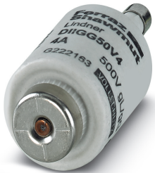
Fuse insert, nominal current: 4 A, length: 50 mm, diameter: 22 mm, color: brown

Please be informed that the data shown in this PDF Document is generated from our Online Catalog. Please find the complete data in the user's documentation. Our General Terms of Use for Downloads are valid ( http://phoenixcontact.com/download )