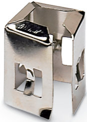
NEOZED special spring, for using fuse inserts D 01, in threaded caps D 02, for 2 A ... 16 A

Please be informed that the data shown in this PDF Document is generated from our Online Catalog. Please find the complete data in the user's documentation. Our General Terms of Use for Downloads are valid ( http://phoenixcontact.com/download )