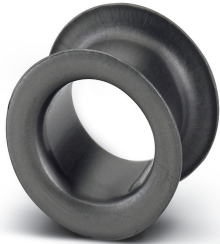
Adapter sleeve, nominal current: 16 A, color: gray

Please be informed that the data shown in this PDF Document is generated from our Online Catalog. Please find the complete data in the user's documentation. Our General Terms of Use for Downloads are valid ( http://phoenixcontact.com/download )