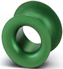
Adapter sleeve, nominal current: 6 A, color: green

Please be informed that the data shown in this PDF Document is generated from our Online Catalog. Please find the complete data in the user's documentation. Our General Terms of Use for Downloads are valid ( http://phoenixcontact.com/download )