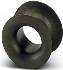
Adapter sleeve, nominal current: 4 A, color: brown

Please be informed that the data shown in this PDF Document is generated from our Online Catalog. Please find the complete data in the user's documentation. Our General Terms of Use for Downloads are valid ( http://phoenixcontact.com/download )