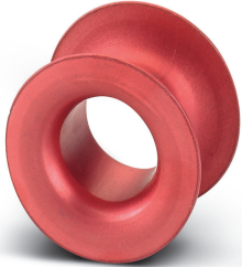
Adapter sleeve, nominal current: 2 A, color: pink

Please be informed that the data shown in this PDF Document is generated from our Online Catalog. Please find the complete data in the user's documentation. Our General Terms of Use for Downloads are valid ( http://phoenixcontact.com/download )