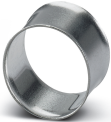
Adapter sleeve, nominal current: 50 A, color: white

Please be informed that the data shown in this PDF Document is generated from our Online Catalog. Please find the complete data in the user's documentation. Our General Terms of Use for Downloads are valid ( http://phoenixcontact.com/download )