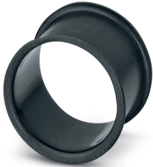
Adapter sleeve, nominal current: 35 A, color: black

Please be informed that the data shown in this PDF Document is generated from our Online Catalog. Please find the complete data in the user's documentation. Our General Terms of Use for Downloads are valid ( http://phoenixcontact.com/download )