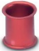
Adapter sleeve, nominal current: 10 A, color: red

Please be informed that the data shown in this PDF Document is generated from our Online Catalog. Please find the complete data in the user's documentation. Our General Terms of Use for Downloads are valid ( http://phoenixcontact.com/download )