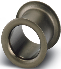
Adapter sleeve, nominal current: 4 A, color: brown

Please be informed that the data shown in this PDF Document is generated from our Online Catalog. Please find the complete data in the user's documentation. Our General Terms of Use for Downloads are valid ( http://phoenixcontact.com/download )