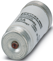
Fuse insert, nominal current: 63 A, length: 36 mm, diameter: 15 mm, color: copper-colored

Please be informed that the data shown in this PDF Document is generated from our Online Catalog. Please find the complete data in the user's documentation. Our General Terms of Use for Downloads are valid ( http://phoenixcontact.com/download )