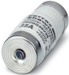
Fuse insert, nominal current: 35 A, length: 36 mm, diameter: 15 mm, color: black

Please be informed that the data shown in this PDF Document is generated from our Online Catalog. Please find the complete data in the user's documentation. Our General Terms of Use for Downloads are valid ( http://phoenixcontact.com/download )