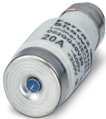
Fuse insert, nominal current: 20 A, length: 36 mm, diameter: 15 mm, color: blue

Please be informed that the data shown in this PDF Document is generated from our Online Catalog. Please find the complete data in the user's documentation. Our General Terms of Use for Downloads are valid ( http://phoenixcontact.com/download )