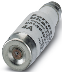
Fuse insert, nominal current: 4 A, length: 36 mm, diameter: 11 mm, color: brown

Please be informed that the data shown in this PDF Document is generated from our Online Catalog. Please find the complete data in the user's documentation. Our General Terms of Use for Downloads are valid ( http://phoenixcontact.com/download )